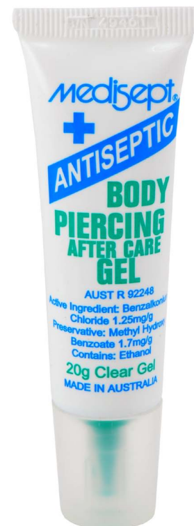
MediSept® After Piercing Care Gel 20g